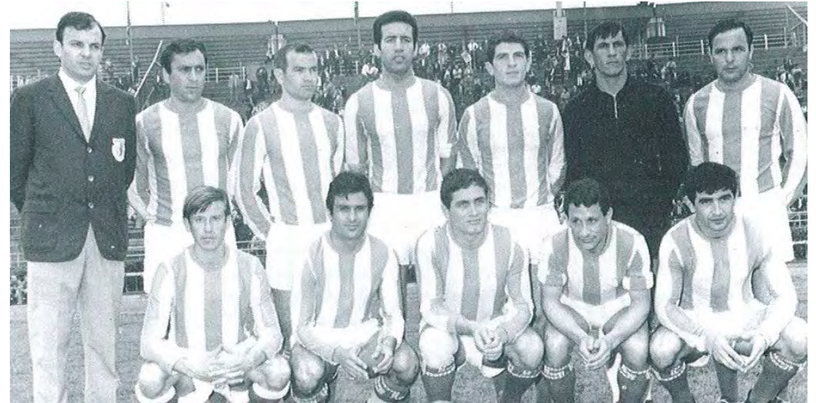
Greek-American AA competed against Somerset CC (BER), CD Toluca (MEX)