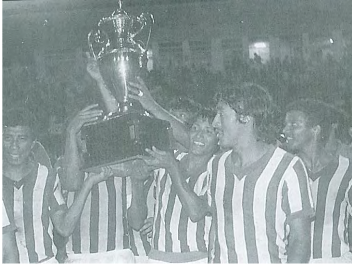
CD Olimpia lifted its first Champions' Cup trophy by topping SV Robinhood (SUR) in '72 finals