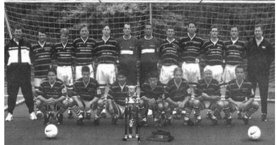
Seattle Sounders was the last non-MLS club to represent U.S. at Champions' Cup

Research details completed and available upon request; and any additional information are also welcomed