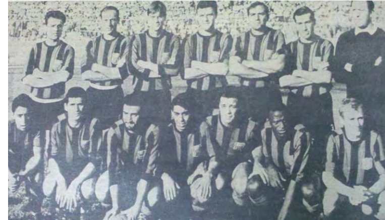
Team prior to playoff game against hosts Alianza FC (SLV) at Estadio Flor Blanca in San Salvador

Research details completed and available upon request; and any additional information are also welcomed