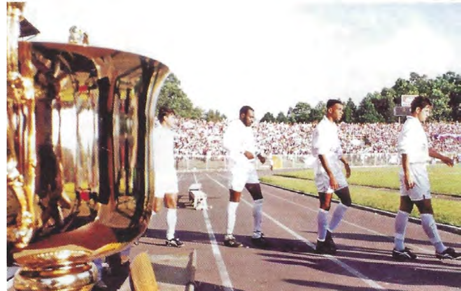
Saprissa enters pitch before later lifting '95 trophy