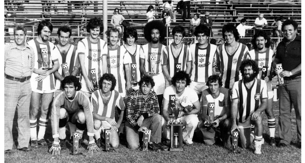
Maccabee AC was scheduled to meet Pumas UNAM (MEX) at '78 Champions' Cup