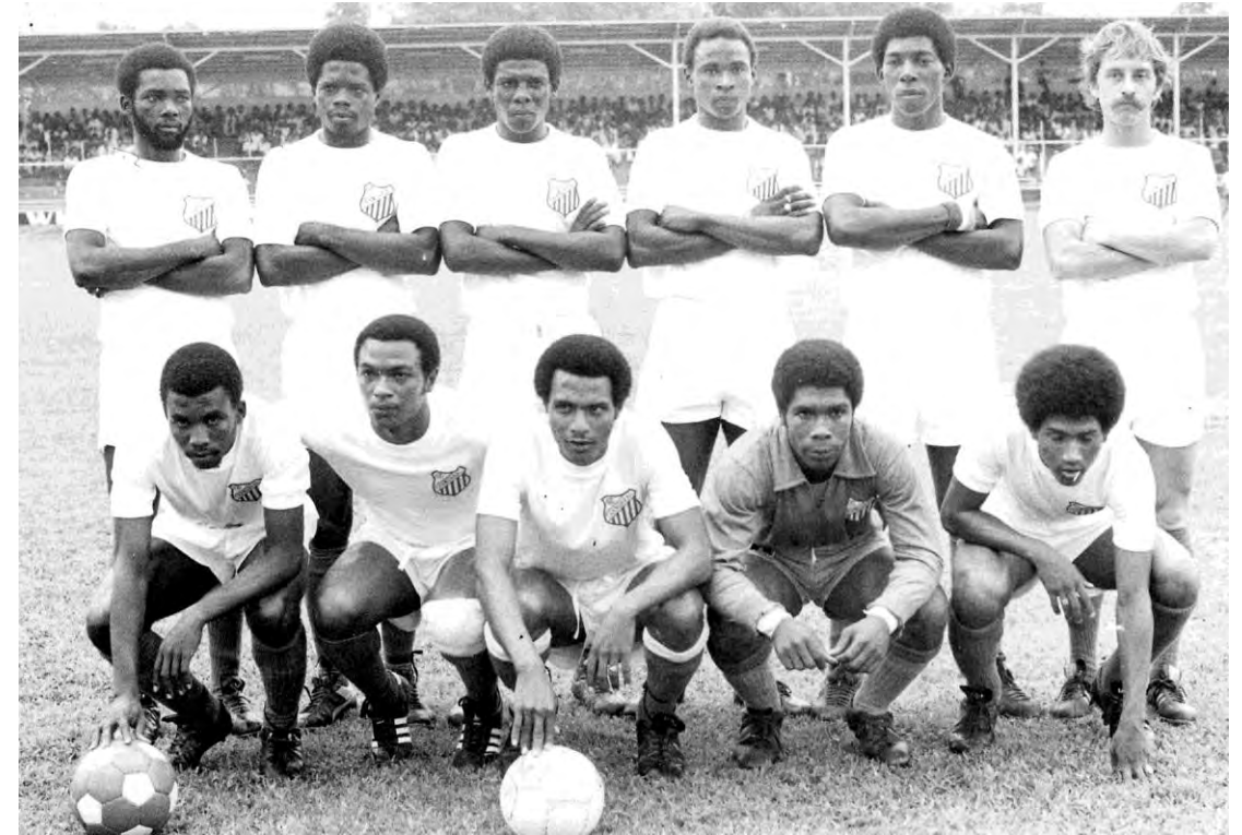
SV Transvaal (SUR) became first non-North/Central American team to lift the Champions' Cup trophy