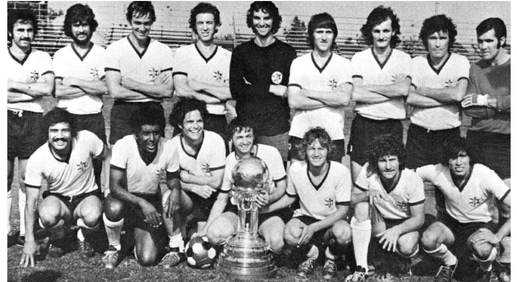
Maccabee AC first club from The Golden State to qualify for Champions' Cup in '74