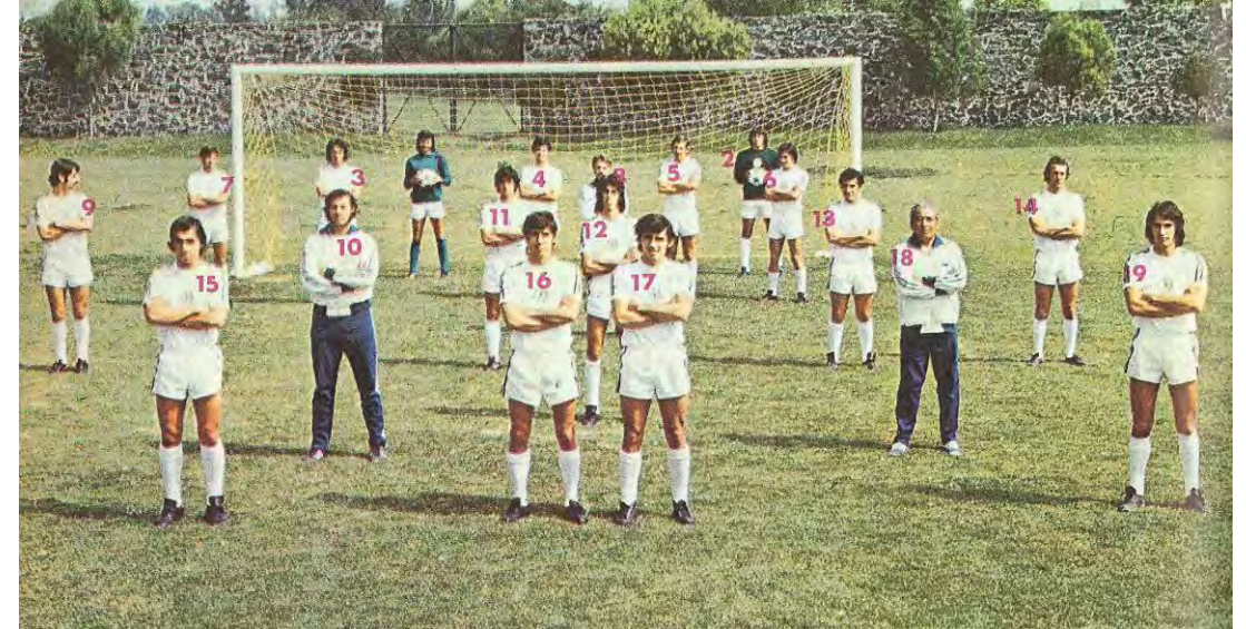
Formed in '71, Atlético Español was youngest club at the time, to win Champions' Cup