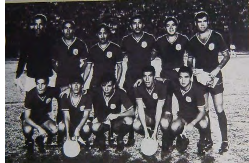
Cruz Azul wins its first Champions' Cup in '69