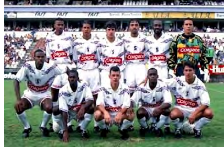
Deportivo Saprissa became first Costa Rican club to win two Champions' Cups in '95