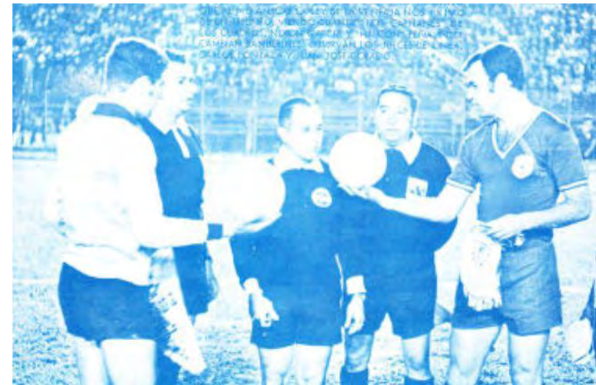
Cruz Azul faced Comunicaciones (GUA) in '69 Final Series