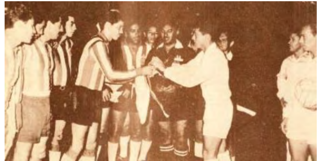
Chivas vs. Comunicaciones (GUA) during '62 Champions' Cup Finals