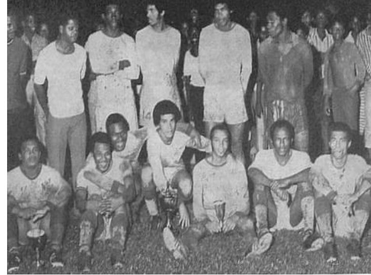
SV Transvaal with '73 Champions' Cup trophy