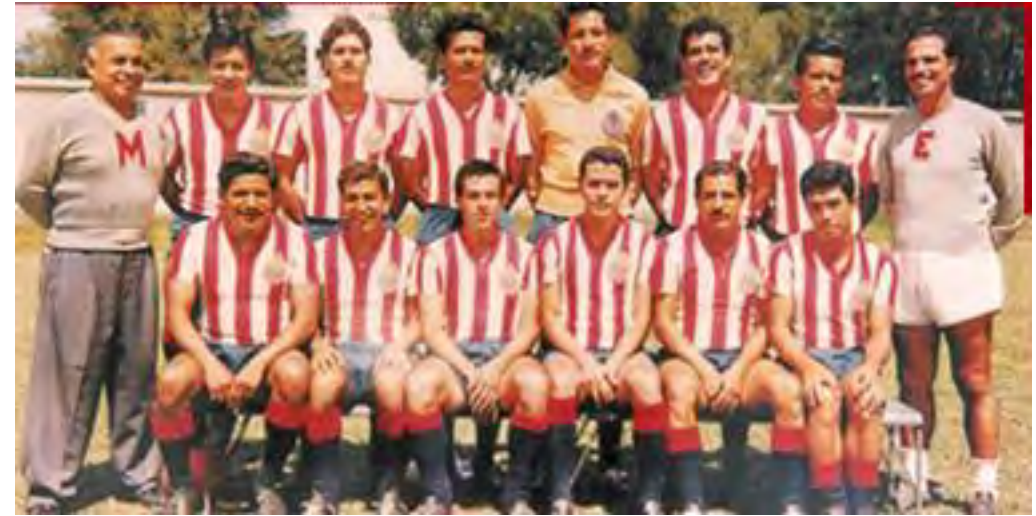
Chivas won inaugural Champions' Cup in '62