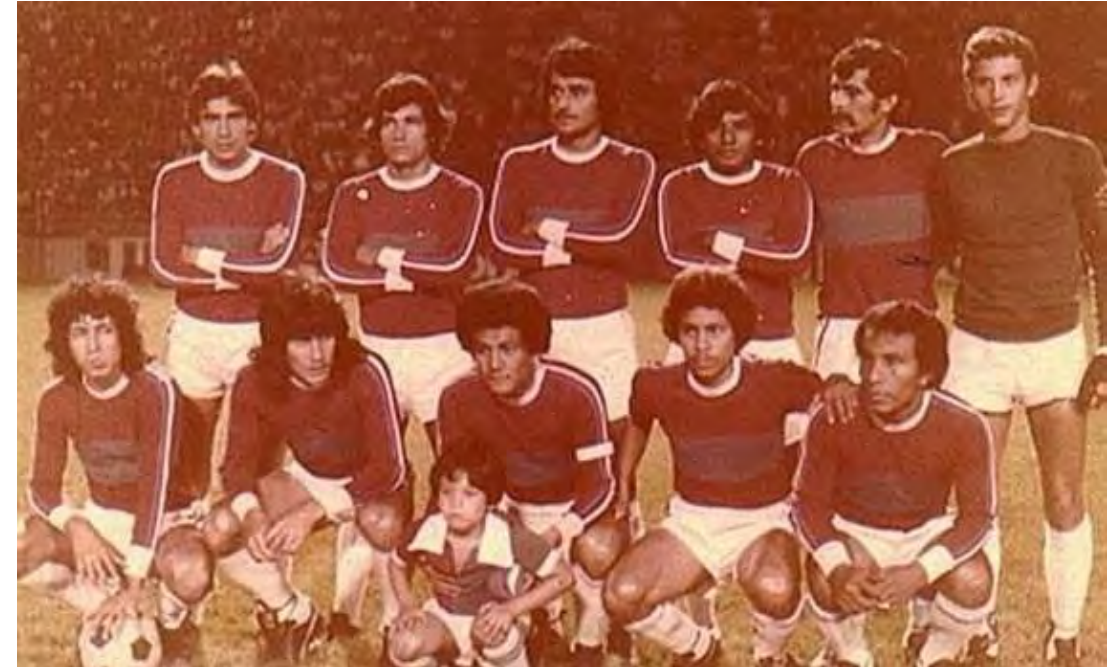
After tying first-leg of '79 finals, hosts FAS won the return-leg over Jong Colombia to lift its first Champions' Cup trophy