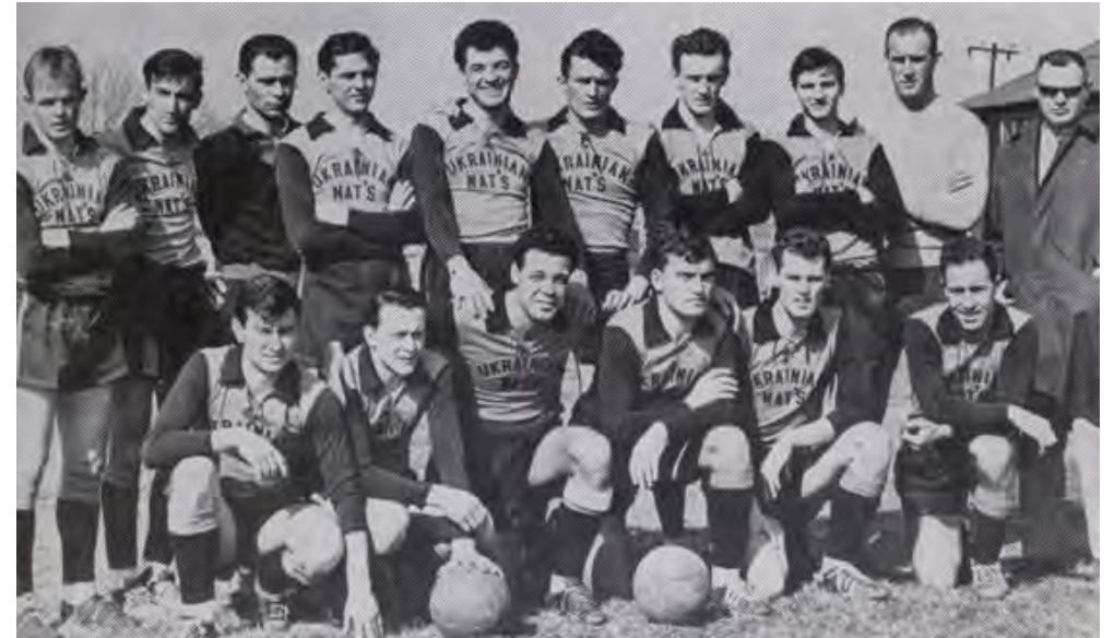
Ukrainian Nationals was scheduled to face Club América (MEX)