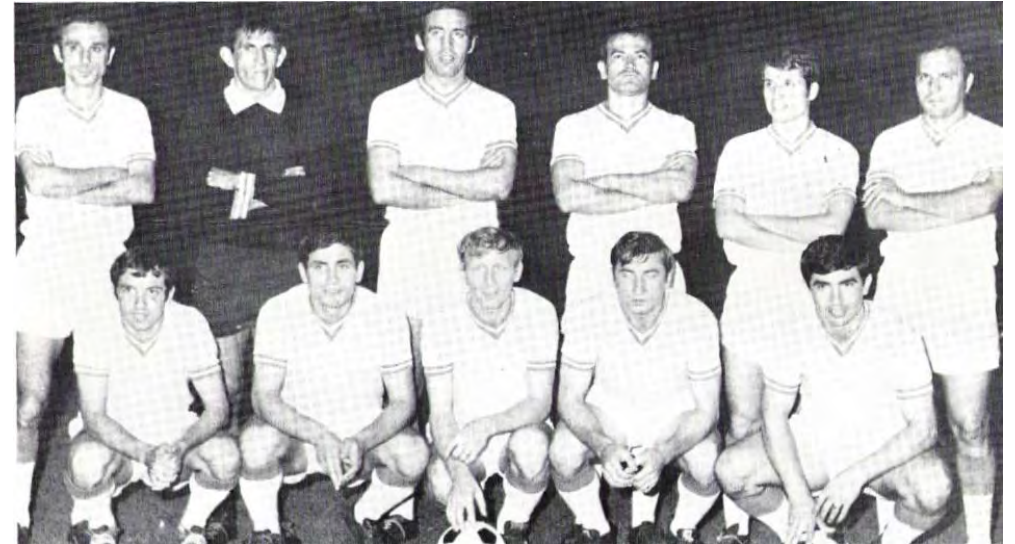
Greek American AA squared off against Cruz Azul (MEX) at Champions' Cup