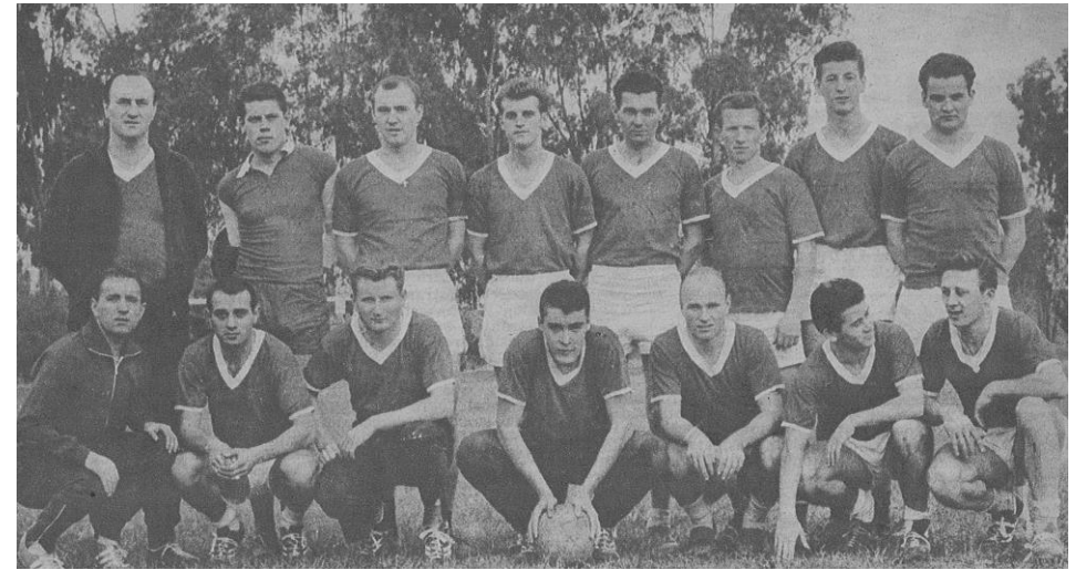
NY side in Mexico City prior to departing for Guadalajara

Research details completed and available upon request; and any additional information are also welcomed