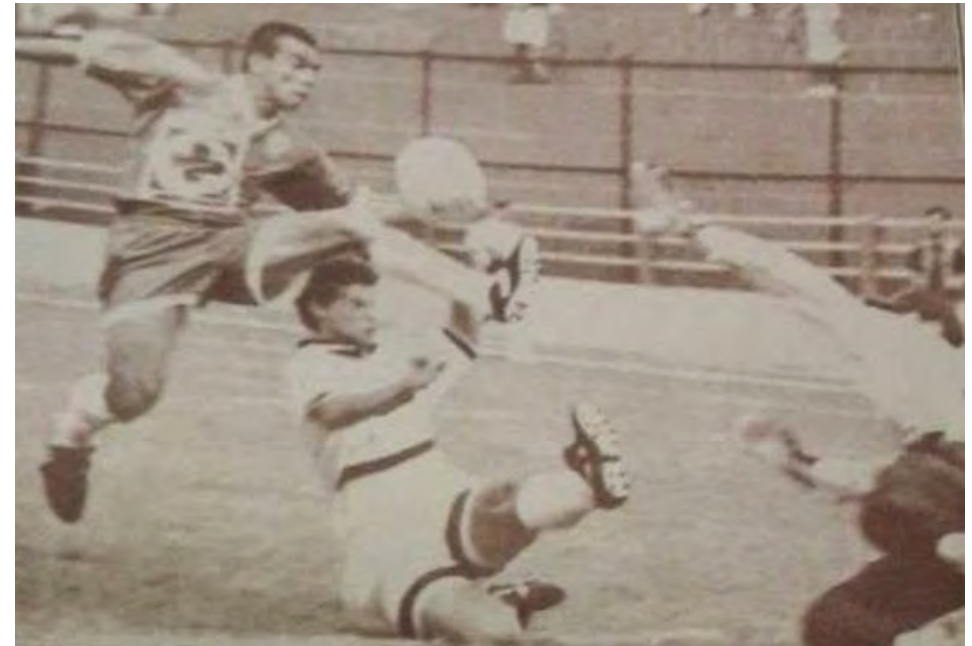
Seattle in action vs. Cruz Azul at Guatemala City's Estadio Mateo Flores