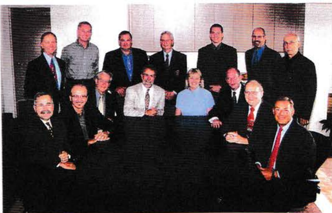
National Soccer Hall of Fame Board of Directors: