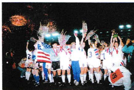
U.S. Team Celebrates Historic Victory in China