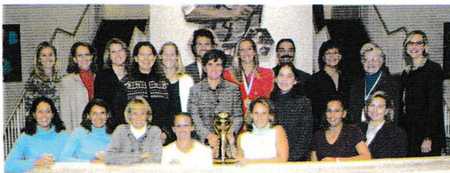
1991 Women's National Team