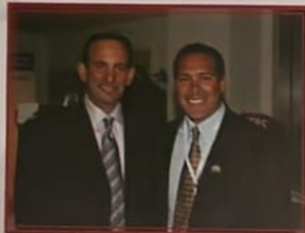
Don Garber (L) with Paul Caligiuri

"We are all fortunate to have a place like the Hall of Fame to honor and enshrine those individuals who have truly made a difference in our sport...Paul Caligiuri had one of the most storied careers in US soccer history...we build Halls of Fame for people like Paul...a man whose determination and love of the game changed the course of soccer history."