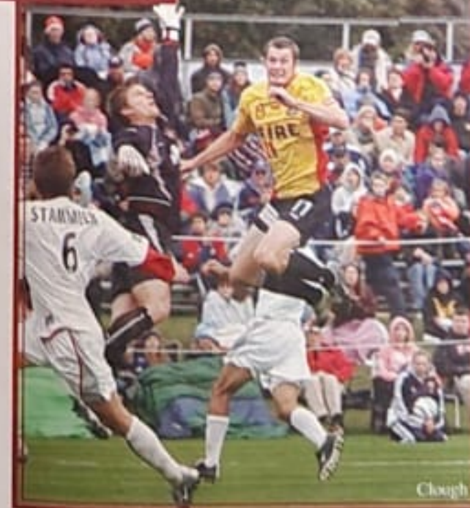
Above: Great Action

Eric Wynalda "It means a lot to me to be part of the history of this game...it's a wonderful history with a great future...I've always been a dreamer. If I wasn't a dreamer I would not be here today"