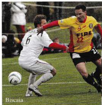
Even at his advanced age they still have to grab Wynalda's shirt to stop him

Newly inducted Hall of Famer Eric Wynalda made a guest appearance for his old team, the Chicago Fire, entering the game in the 73rd minute. He had, perhaps, the Fire's best chance of the game when he broke away in the closing minutes only to push his shot just wide of the goal.