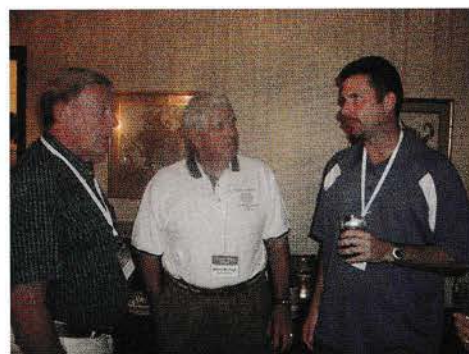
Willy Schaller, Harry Keough and Michael Windischmann