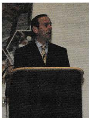
MLS Commissioner Don Garber

"At Major League Soccer, we're trying to do for this country what you have done for the people of the region and that is to create a place where people of all backgrounds, ethnicities and ages come together to celebrate our great game... You have built a permanent tribute to honor all those who helped establish a foundation for soccer in America... Our sport has such an amazing and storied history... We at MLS are committed through all means necessary to continue building the great history showcased here in the Hall and build a future all of us can be proud of."