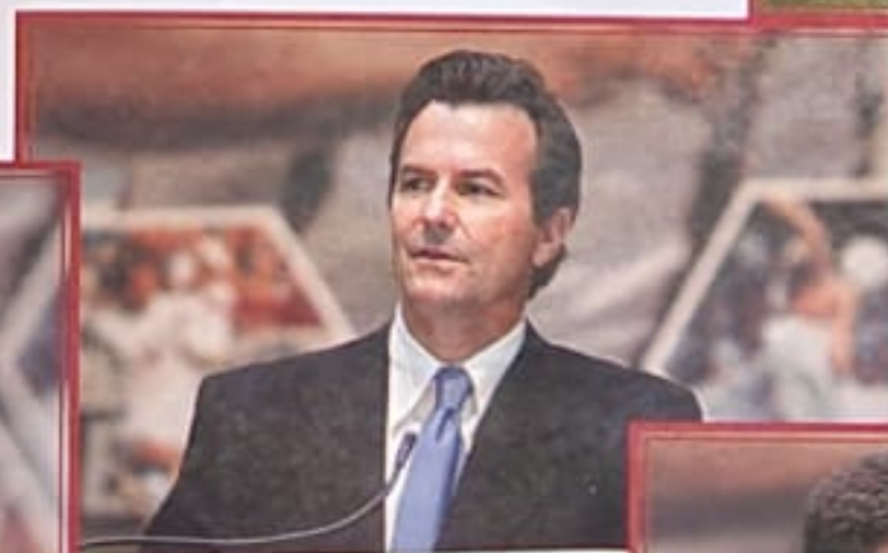
Left: Anson Dorrance introduces Michelle Akers

"I have cherished these cleats for the last 15 years...the ones I wore on November 19, 1989 when I scored the goal that beat Trinidad & Tobago and is now described as one of the most significant goals in US soccer history...The Hall of Fame is forever, representing the past, the present and the future. Between these walls are so many memories, so many stories...I'm privileged to add my story...Today I coach, I dream of tomorrow, and forever this game is my life."