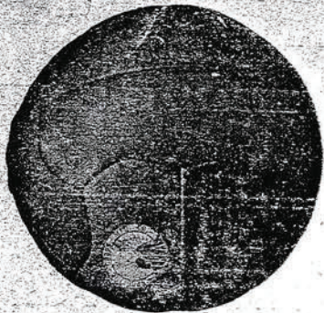
DUNDONIAN STYLE THE EVERLAST OFFICIAL

The Official Ball adopted by the Prominent Soccer Clubs in the Country and Officially used in all the Cup Ties.