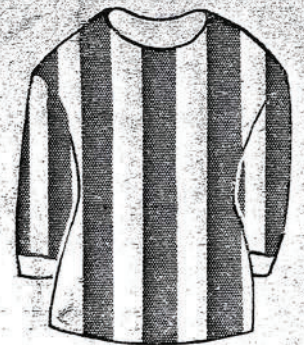
EVERLAST Soccer Jerseys

IF YOU ARE CONTEMPLATING OUTFITTING YOUR TEAM,