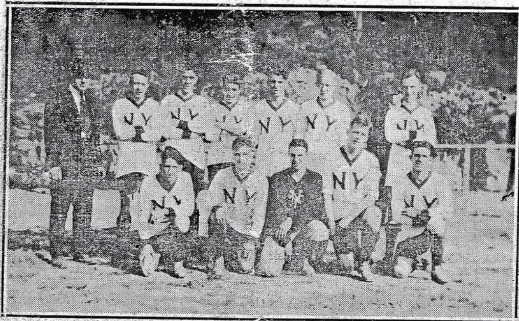
THE NEW YORK FOOTBALL CLUB EVERLAST EQUIPPED